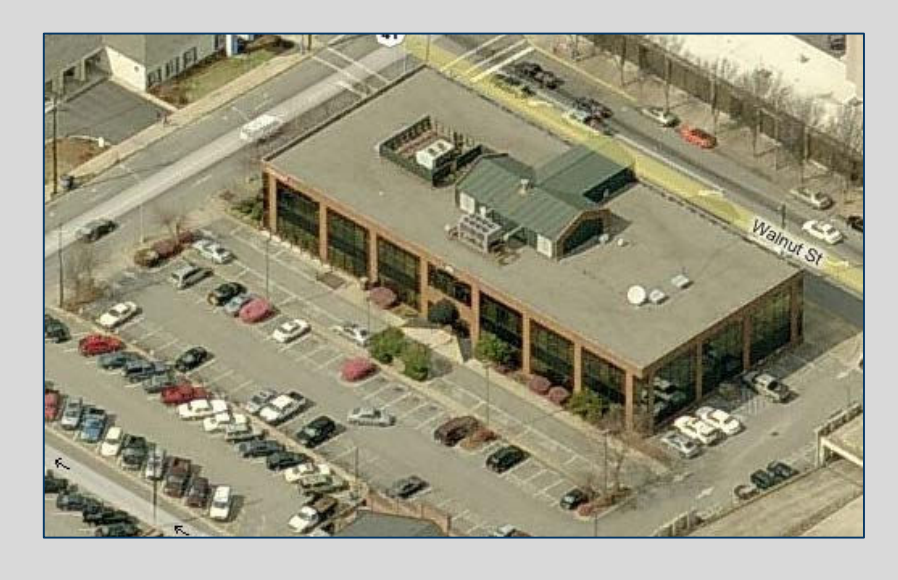
• <u>SUITE 102</u> – 2,040 SF ground level space