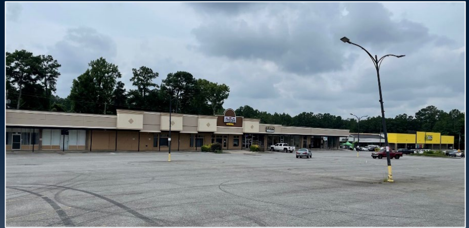
SHURLINGTON PLAZA, Macon, GA