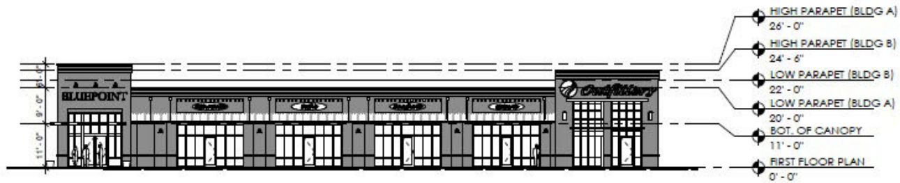
1 DD- FRONT ELEVATION A3.0 SCALE: 1/16" = 1'-0"