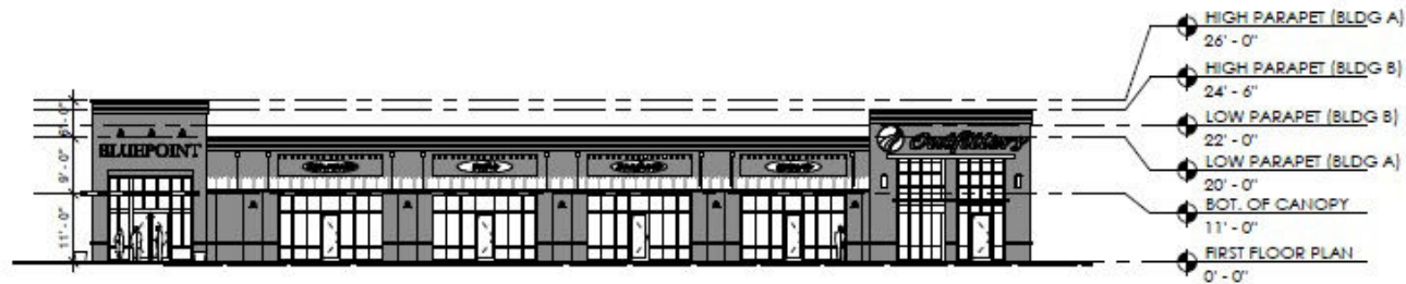
1 DD- FRONT ELEVATION A3.0 SCALE: 1/16" = 1'-0"