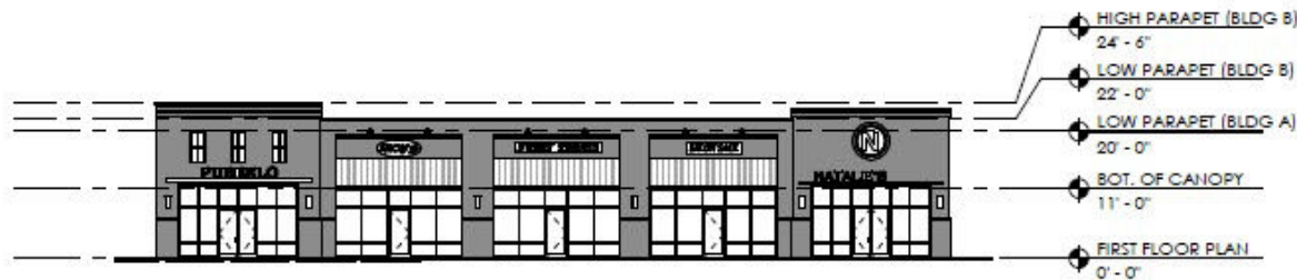
2 DD- FRONT ELEVATION Copy 1 A3.0 SCALE: 1/16" = 1'-0"

The information contained herein has been compiled from various sources, both private and public. It is accurate and complete only to the extent to which The Summit Group has been able to ascertain from third party sources. As such, no warranty or guarantee is given or implied with regard to the accuracy or completeness of any information contained herein. Any interested party shall be required to conduct its own due diligence and investigations to verify, review, audit, or otherwise ensure the information contained herein.