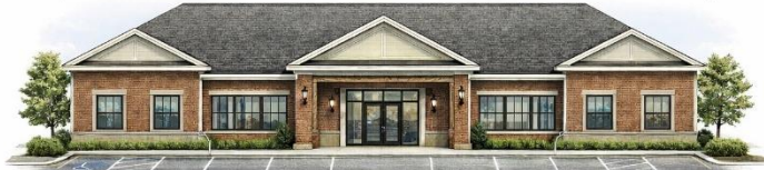
OFFICE BUILDING PLAN & ELEVATION FOR DOWNTOWN PERRY